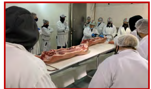
OSU students grading the pork.

PCCF and the Pickaway County Farm Bureau partnered for the second year in a row to submit a packer bid at the Pickaway County Fair. The packer bid provides the youth with a premium bid that awards them for the hard work that goes into a project that takes considerable time and effort. The seventeen beef will be processed and delivered to local food pantries to be distributed throughout Pickaway County.