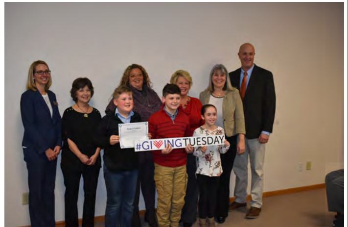
A pledge presented to the students of Saltcreek Intermediate School for their work with problem based learning during a project with Ohio Means Jobs and the Pickaway WORKS program.

For more details on each of these grant recipients, please refer to the news section of yourpccf.org .